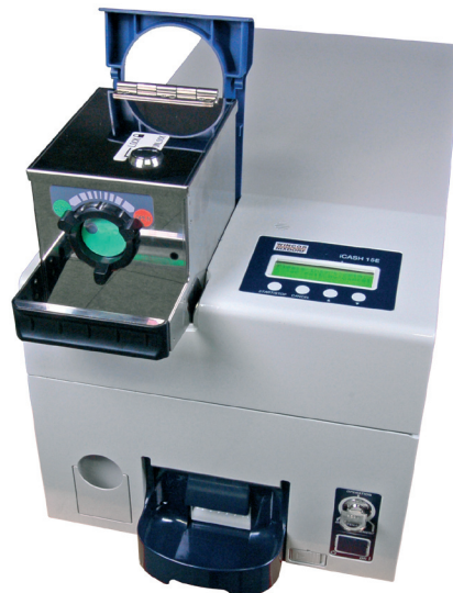
Refill cassette attached