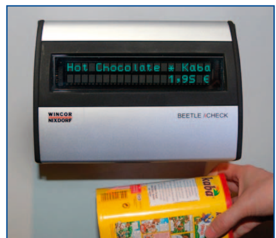
BEETLE /iCHECK - Wall mounting