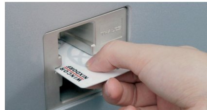
Hybrid card reader