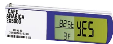
Merchandise management info., test mode message