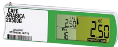
Price with promotion symbol and bonus points